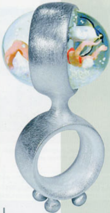
Surprising items instead of expensive products: the ring "Ooops" tells the odd tale of the women swimming backstroke