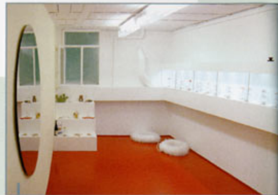
Seek and you will find: a view of the new exhibition room "Truffle"