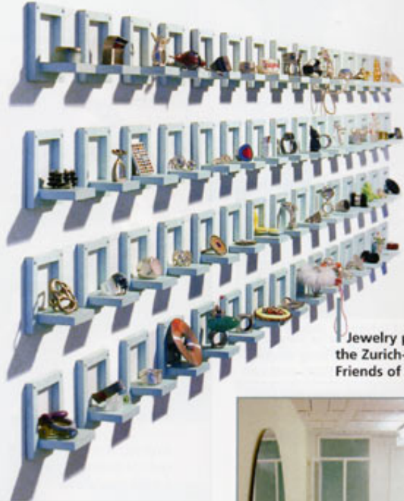
Jewelry presentation in the Zurich-based gallery Friends of Carlotta