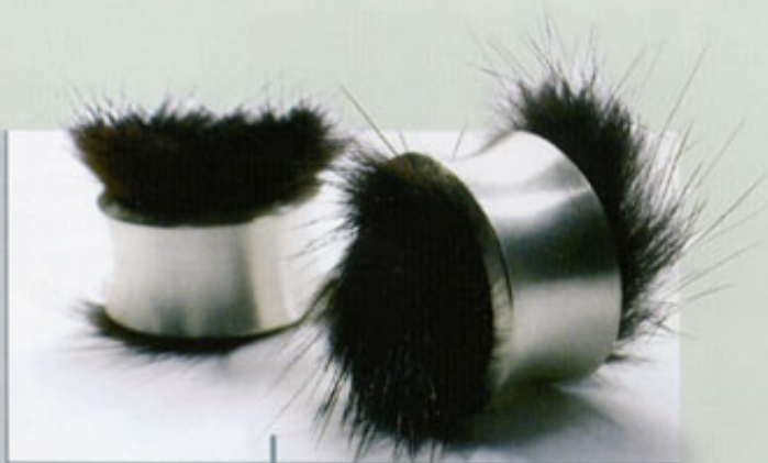
An eye catcher, not just on cold days: The finger muffs by jewelry designer Kirsten Grünebaum

used by visitors and jewelry designers in equal measure as a platform for communication. But the reason for the international interest lies deeper than the uniquely large variety of the over 1,000 items of jewelry on show. Instead, the Swiss gallery draws its inimitable character from the extraordinarily relished and humorous range of jewelry and the playfully droll character of the topical exhibitions held once or twice a year. The proud gallery-owner can look back on 18 topical exhibitions since 1995. In regular intervals, between forty and ninety jewelry designers and other designers draw inspiration from the set topics. "Each of the topics is selected in such a way that the participants break out of everyday life and are forced to investigate new areas and thought patterns", is how Bruna Hauert explains her exhibition concept. Creating content through topics instead of degrading jewelry as a simple accessory is the imaginative gallery owner's philosophy. "Using a joint topic lays the foundation for recognizing the broad spectrum and the imaginativeness among designers and also for being in a position to compare and assess the created work." Apropos assessment: The Friends of Carlotta Prize was awarded for the first time as part of the current topical exhibition