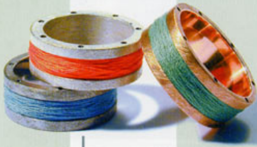
Practical: The Brave Little Tailor – rings with exchangeable thread