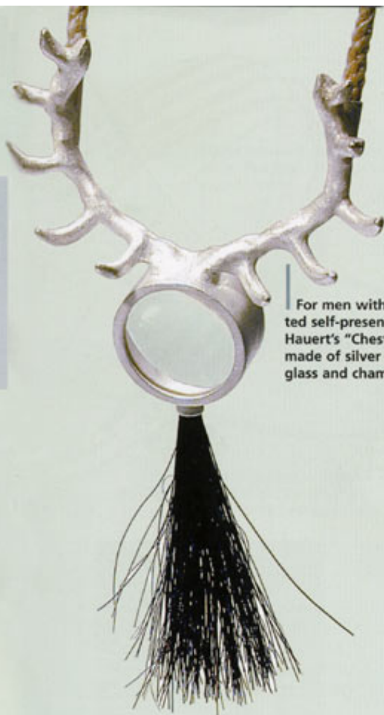
For men with a love of extroverted self-presentation: Bruna Hauert's "Chest Hair Enlarger" made of silver antlers, magnifying glass and chamois beard hair